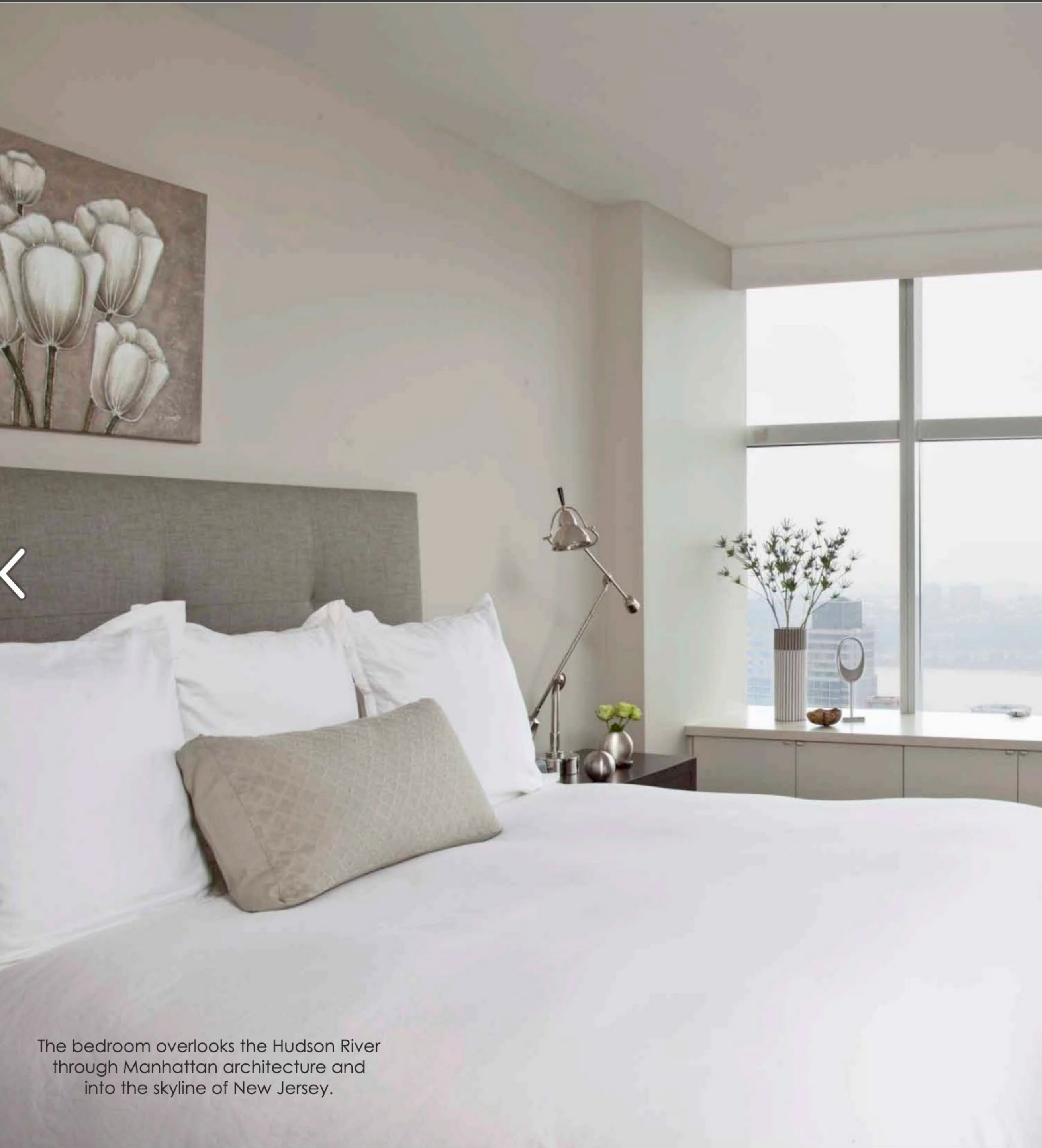
The bedroom overlooks the Hudson River through Manhattan architecture and into the skyline of New Jersey.