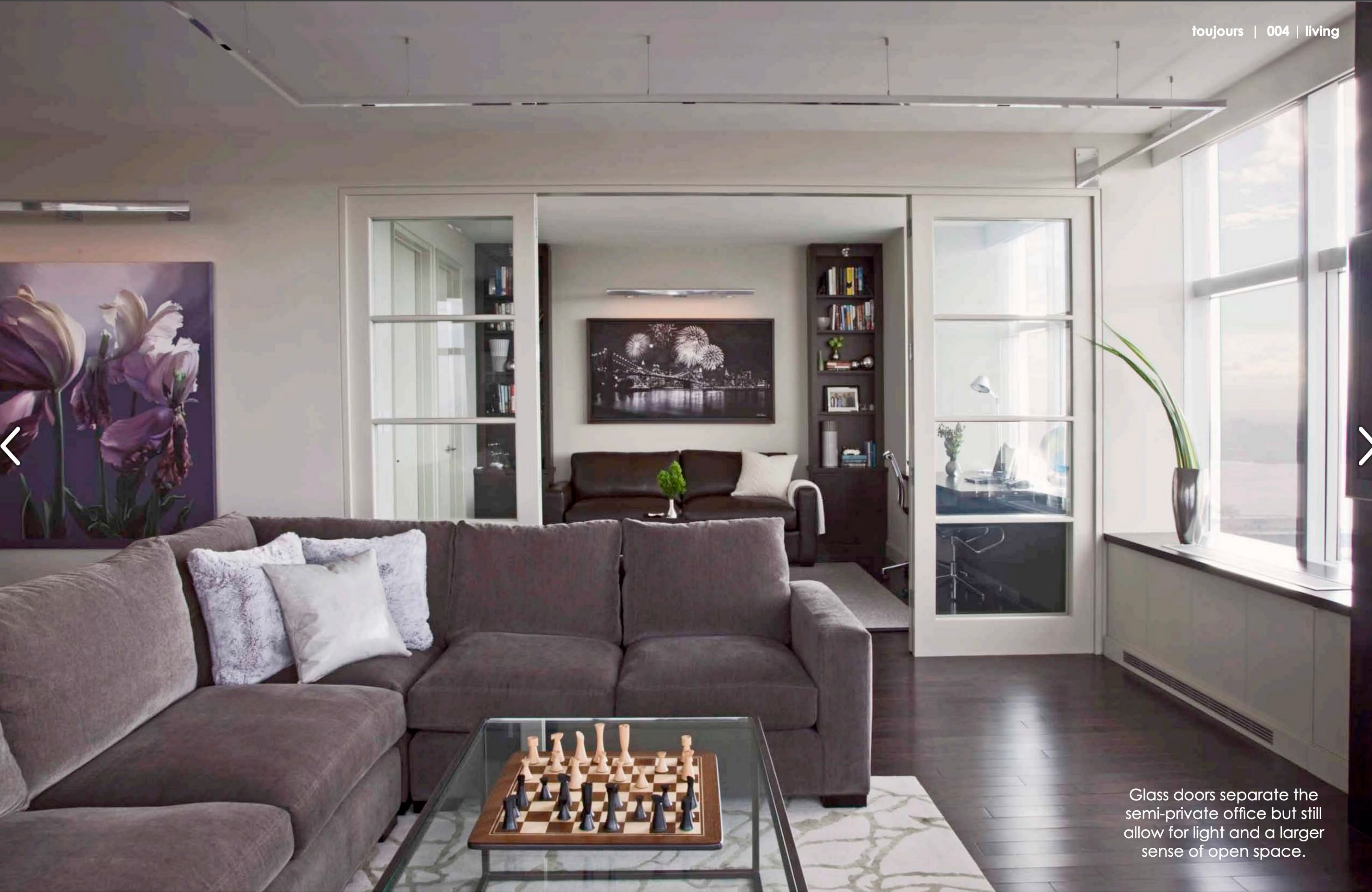
Glass doors separate the semi-private office but still allow for light and a larger sense of open space.